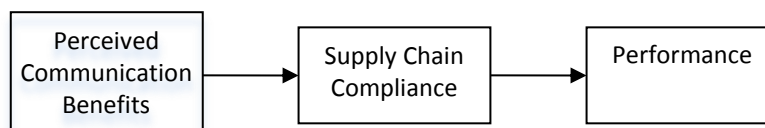
Figure 1. The research conceptual framework.

Figure 1 presents the research conceptual framework: