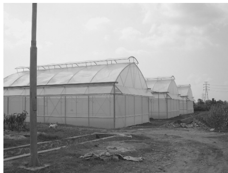
Fig. 3. The new Procult greenhouse design, three greenhouses in a row.