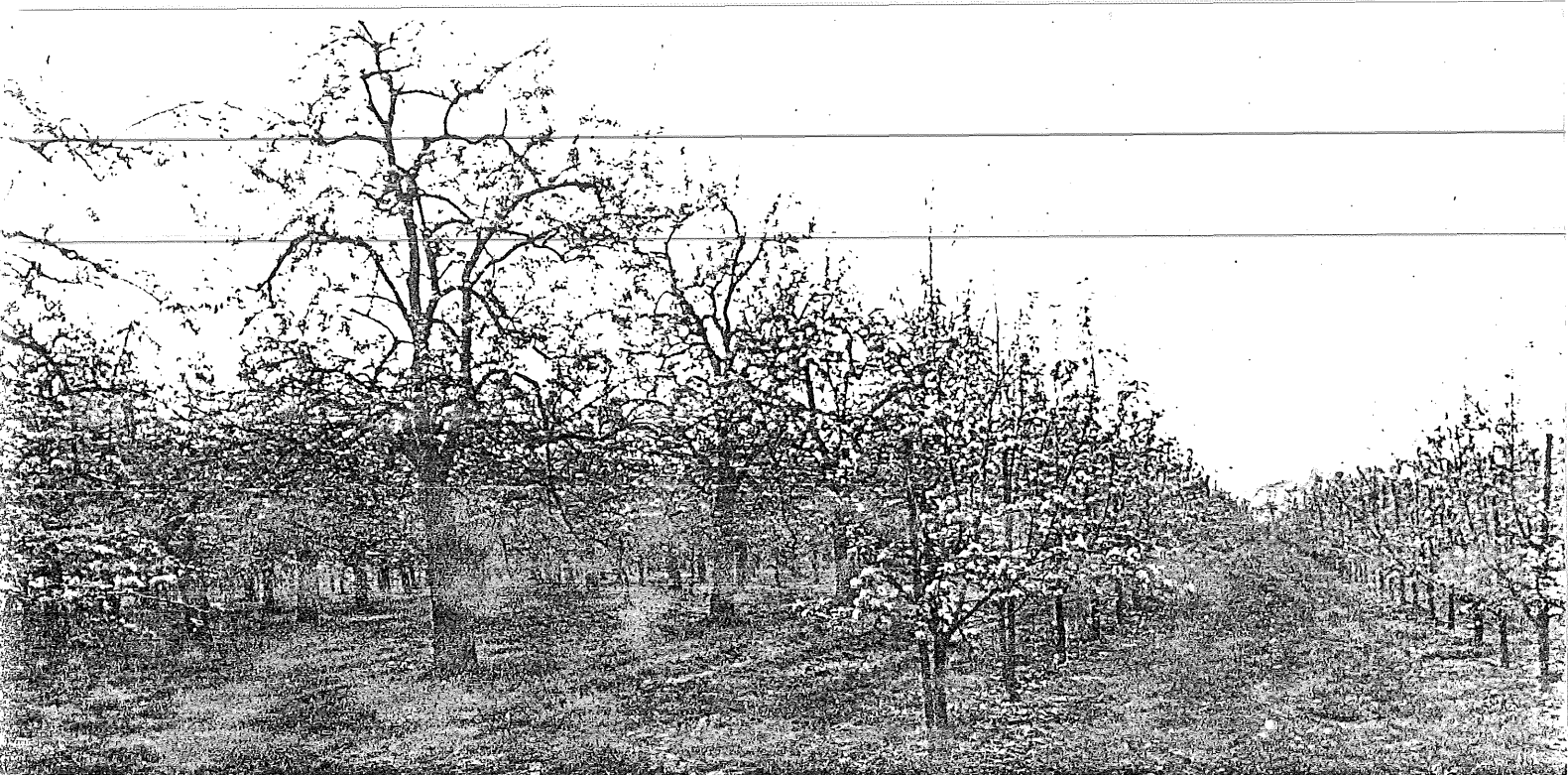
Apple production in the Netherlands where integrated pest control is increasingly widespread