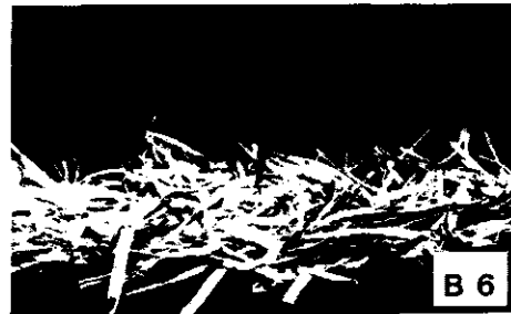
Fig. 1 : Heights of the model crop (side view). Series A : "standing" crop, height 8 - 8½ cm, Series B : "lodged" crop, height 5 - 5½ cm, (A and B) 12, 10, 6 : plant spacing in cm.