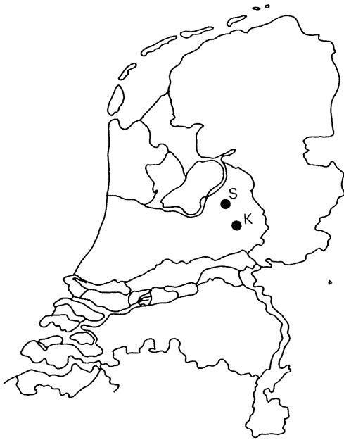
Fig. 1. Location of the two ACIFORN Douglas-fir stands in the Netherlands: K = Kootwijk and S = Speuld.

The two ACIFORN stands were planted on clearcut areas with a coastal provenance of Douglas-fir ( Pseudotsuga menziesii (Mirb.) Franco), and are located 10 km apart in the 'Veluwe' area in the Netherlands (Figure 1). The stands are