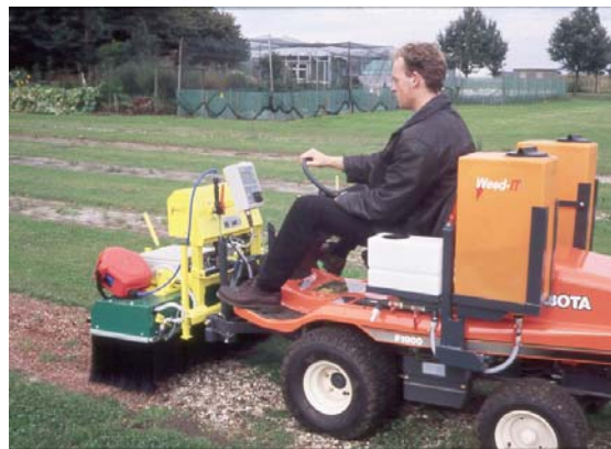
Weed IT machine