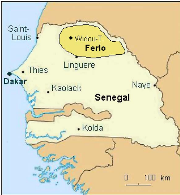
Fig. 1 The Ferlo

from deep aquifers, and perennial water sources are now available throughout the Ferlo (Ministère de l'Hydraulique 1987). The drilling of the boreholes, in combination with government policies aimed at settling local people in order to facilitate their incorporation in the administrative system, caused a concentration of grazing pressures and led to the creation of denuded zones around the wells (Sinclair and Fryxell 1985).