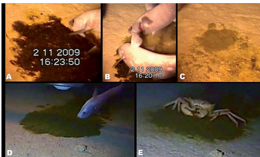
Fig. 5A-C. Behaviour of grenadier fishes at the phytodetritus patch at 3000 m on the Atlantic Iberian margin. (A) Attraction to and investigation of the phytodetritus, (B) investigation and ingestion of phytodetritus, (C) the diminished phytodetritus patch after a few hours.

This study suggests that deep-sea fish, such as grenadiers on the Atlantic Iberian margin, is attracted to phytodetritus in areas where this reaches the sea-floor regularly. The study represents to our knowledge the first in situ documentation of deep-sea fish ingesting plant material and phytodetritus and highlights the variability in the scavenging nature of deep-sea fish. In the future, we will try to quantify the exact contribution of this vegetarian food source to the diet of grenadiers. A BBC news video clip of our spinach experiment can be viewed via www.nioz.nl/media .