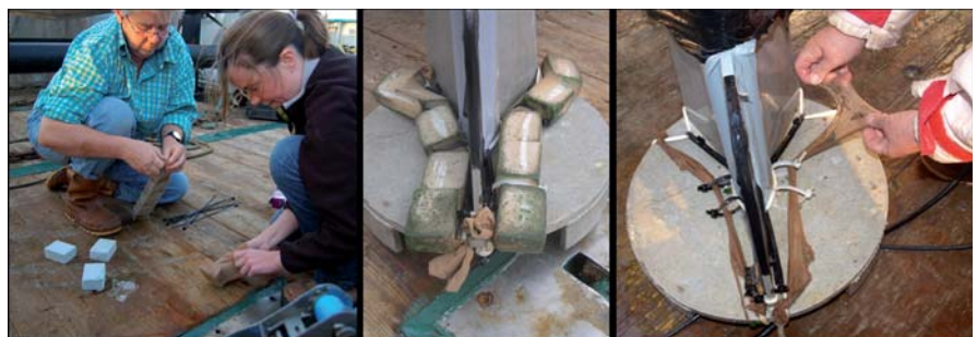
Fig. 1. Preparing the spinach bait at the foot of the ALBEX lander (Autonomous Lander for Benthic Experiments). Right panel is after a 5 hours deployment.

peels, oranges, and algae. These latter observations led us to the question: is plant material also an attractive food source for deep-sea fish? In October 2008 we simulated a plant food fall using spinach blocks fitted at a benthic lander equipped with a baited