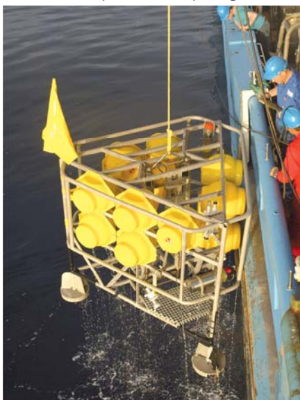
Fig. 2. Recovery of the ALBEX lander with the spinach experiment.

Deep-sea communities living at and near the sea floor in the deep ocean primarily rely on food sources produced at other places. This is often in the form of remains of algae and zooplankton which live in the upper 200 m of the oceans and sink to the sea floor after dying. Benthic invertebrates such as sea cucumbers are the primary consumers of this food source. Deep-sea grenadiers are the most abundant bottom-living fish in the deep ocean; they are generally considered to be the top predators/scavengers in deep-sea communities. Previous baited camera experiments with bottom landers and stable isotope analyses have demonstrated that carcasses from animals living in surface waters are also an important component in their diets. Some grenadier stomachs even contained vegetable material dumped from ships, e.g. onion