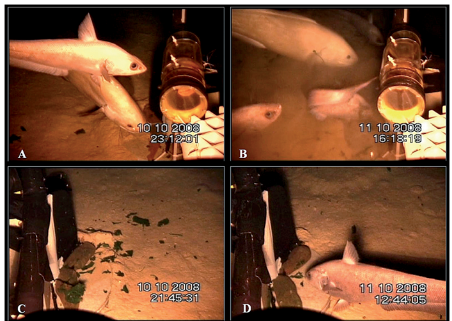
Fig. 3. Behaviour of deep-sea grenadiers and a cusk-eel at the spinach bait at 3000 m on the Atlantic Iberian margin. (A) Attraction to and investigation of spinach bait, (B) 'feeding frenzy', fishes vigorously attacking bait, (C) spinach spilling out of stocking after attack, (D) consumption of spinach by grenadier.

time-lapse camera on the Atlantic Iberian margin at 3000 m depth (Figs. 1 and 2). Deep-sea grenadiers and cusk-eels were rapidly attracted by the bait and fed vigorously on it (Fig. 3). The majority of the bait was consumed within a half hour. These observations indicate that (1) plant