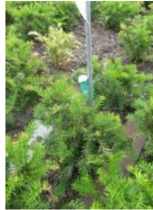
Figure 1 The basket with or without "Odour 6" placed at the top of a plant.

The genus Otiorhynchus is of European origin and the species O. sulcatus (figure 2) is endemic to the temperate zone in Europe. Vine weevil ( Otiorhynchus sulcatus F., Coleoptera: Curculionidae) is a serious pest in a number of ornamental plants and fruit crops in The Netherlands. A new idea of controlling these weevils is by the strategy of "lure and kill". First of all, luring agents were needed. Plant Research International (Wageningen University, The Netherlands) has characterized a few components in a plant-extract that were attractive in the laboratory and in field tests performed in the USA in 2008 in cooperation with the USDA (Van Tol, 2009). A few synthetic odours were tested and attractive, including "Odour 6". This poster deals with the testing of Odour 6 in The Netherlands in 2009: