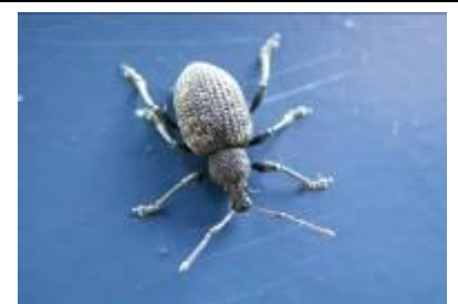
Figure 2 Otiorhynchus sulcatus

At 11 June (week1) the basket with or without "Odour 6" was placed at the top of a plant (figure 1). The nursery was sprayed twice with a crop protection agent, between the 1 st and the 2 nd week and between the 4 th and the 5 th week.