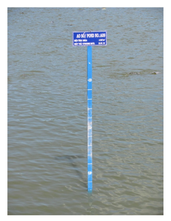
Photo 1. Ruler for recording pond water level changes resulting from draining and filling.

Both RIA2 and Can Tho University staff selected two pangasius farms from the group of farmers they have regular contact with. The farms were located in Vinh Long (2), Dong Thap and Hau Giang provinces and can all be considered as big farms (> 5 ha). Of each farm three ponds were monitored in this study, bringing the total number of monitored ponds to 12. Of each pond the volume was estimated, taking the slopes into consideration. Fixed rulers that indicate water depth were placed in each pond.