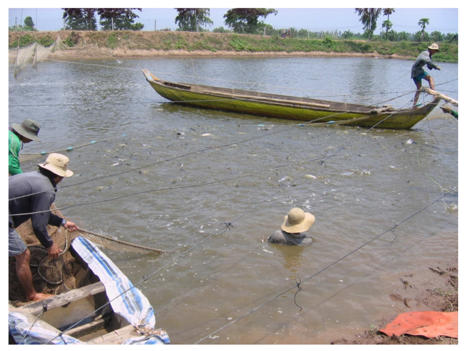
Harvest of Pangasius ponds.