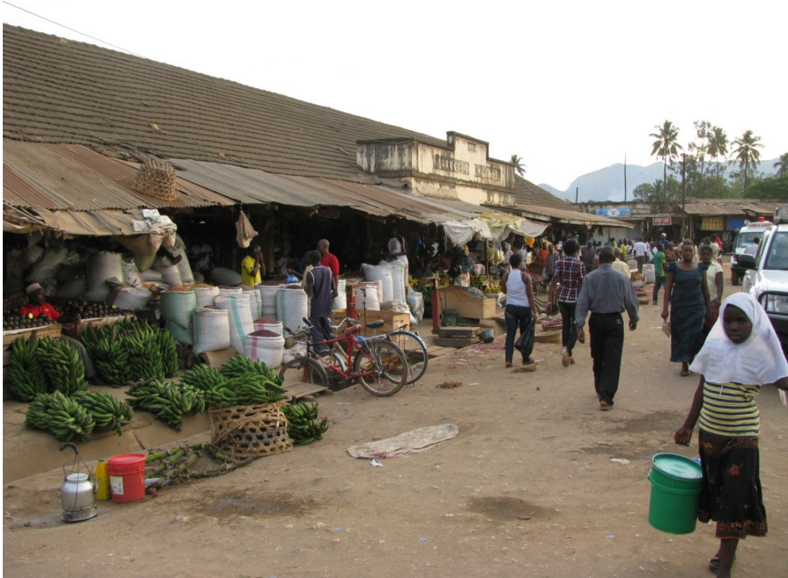
Figure 7 The market of Morogoro