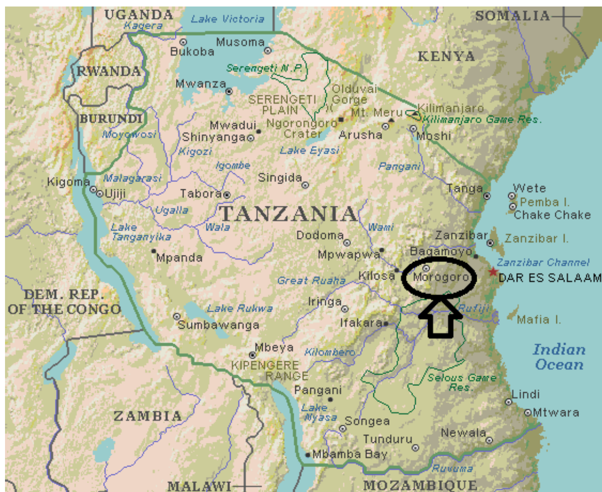
Figure 4 Map of Tanzania (Map of Tanzania, 08-09-2010)

towns of Tanzania, from the 18 th century (Morogoro Municipal Council, 2009). It is surrounded by the Uluguru Mountains and there are three main rivers crossing Morogoro.