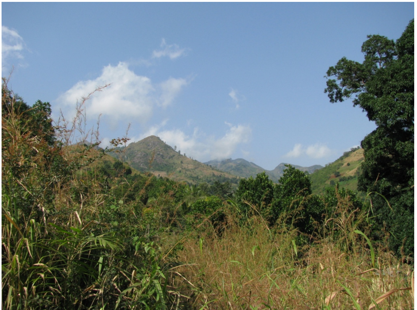
Figure 3 The Uluguru Mountains

The majority of the people living in the rural area is very poor. During the dry season, many people just have one meal a day, as they have nothing more to harvest and mostly do not have food stock. In the wet season, there is enough to eat, as it is harvesting time. However, the living standard vary per region, as some regions are more fertile than others. Morogoro region is one of the fertile regions. Because of the Uluguru mountains (see Figure 3), it has a microclimate with two rain-seasons, the big one around March to May and the small one between October to December. Because of this fruitful climate, Morogoro region is one of the food baskets of Tanzania, together with regions as Arusha, Mbeya and Iringa, which have a colder climate.