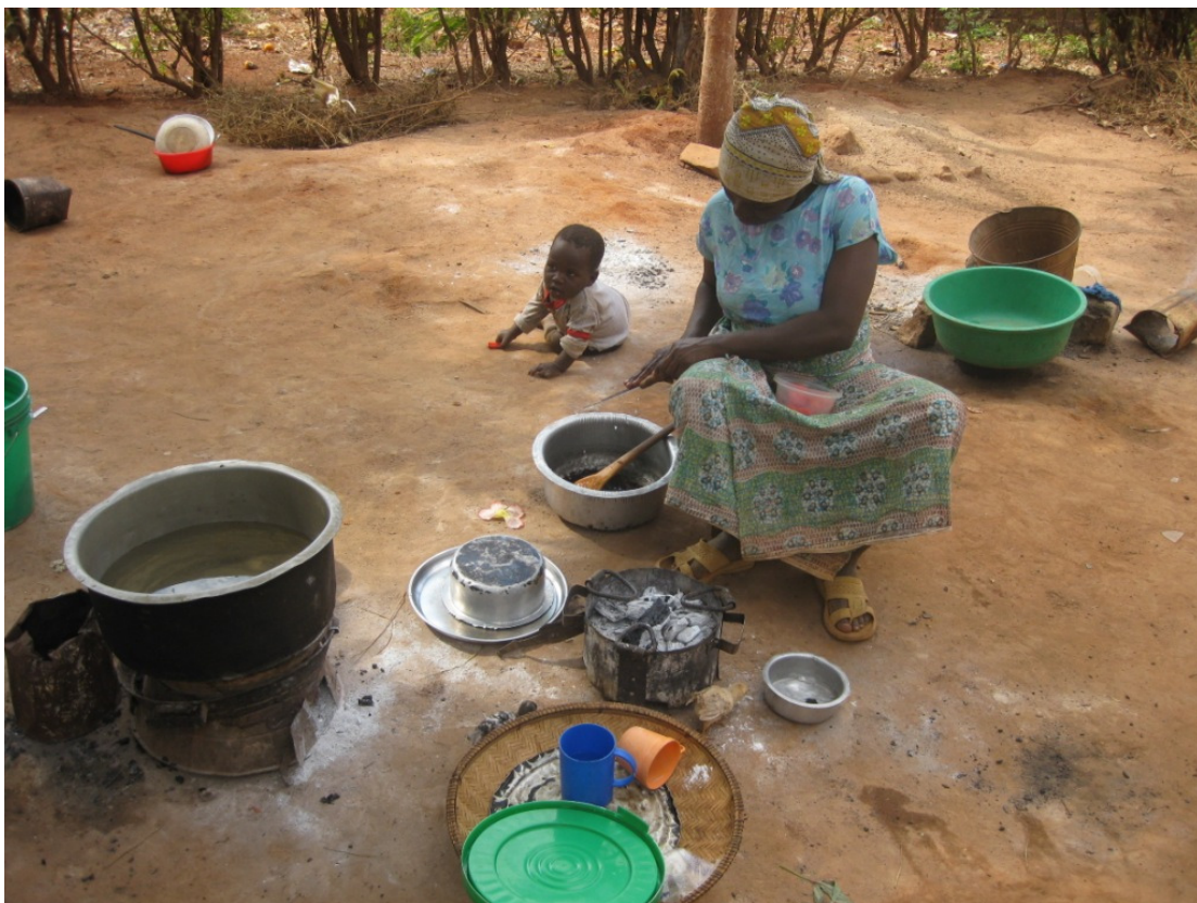
Figure 8 A basic cooking place