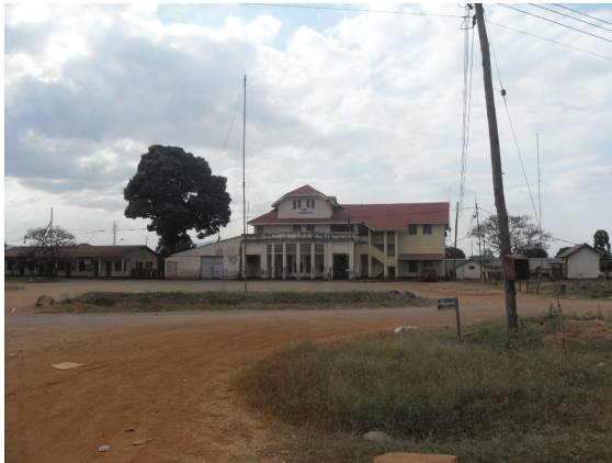
Figure 5 Central railway station

Council, 2009). The Daladala is the local way of transport. These are old minibuses going everywhere in town and its surroundings; they are a cheap way of transport. Everywhere in town, taxis and motorcycle-taxis can be found. Lastly, many people use a bike for transport. The bikes can also be hired for one day in many places in town.