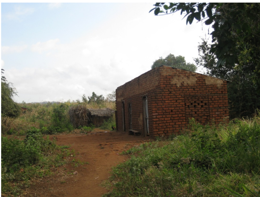
Figure 2 A house in the rural area made from red stone