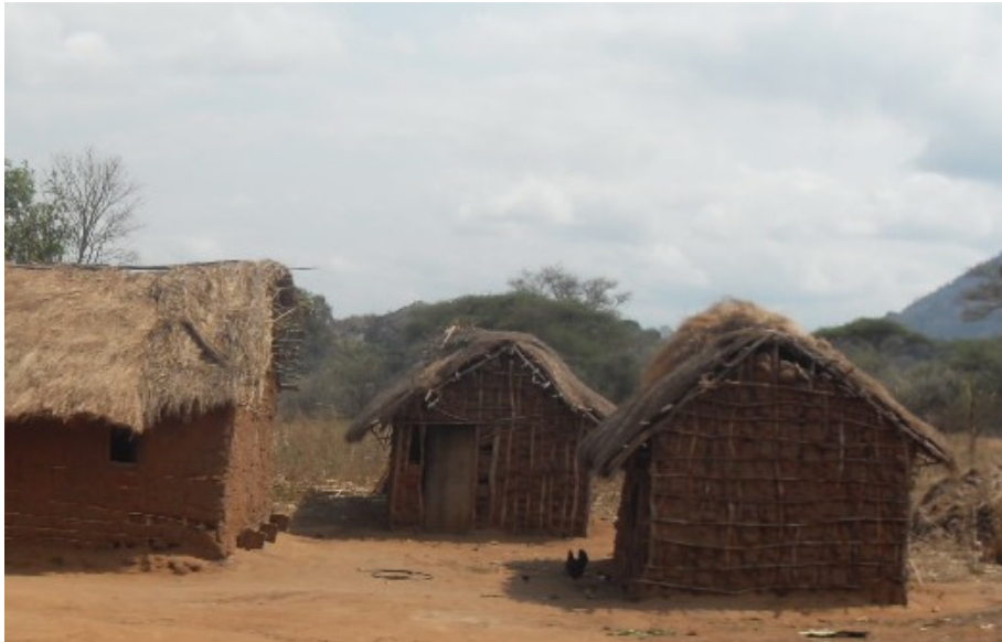
Figure 1 A house in the rural area made from wood, mud and leaves

Many people in the rural area are living together with their family. The houses are basic, the majority lives in houses with walls made from wood and mud, and a roof made from leaves (see Figure 1). Some people live in houses from red stone (see Figure 2).