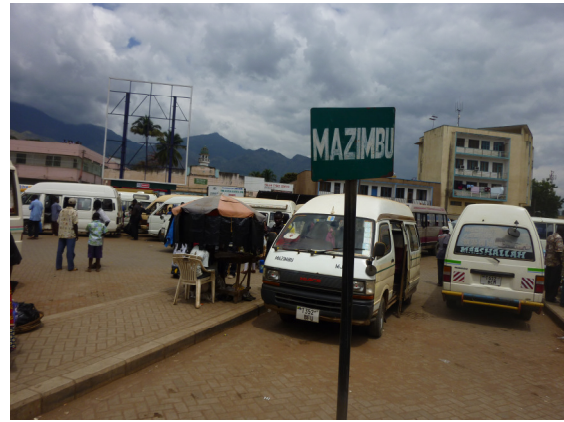
Figure 6 Daladala station

Morogoro has 42 dispensaries, 12 health centres and 3 hospitals (Morogoro Municipal Council, 2009). Morogoro has many churches for many different beliefs. In Morogoro there are 55 nursery schools, 72 primary schools, 34 secondary schools, 3 vocational centres, 2 specialized training centres, 3 universities and 5 special education-centres for disabled children (Morogoro Municipal Council, 2009). Morogoro has a fitness room, a squash course, a tennis course, a golf course and 3 swimming pools available. The golf course and swimming pools are mainly used by the white inhabitants and visitors of the town. Morogoro has many restaurants, some bars and two nightclubs. It also has a big daily market (see Figure 7 on the next page). In this market, everything is sold: food, clothes, shoes, materials. On the Sunday, there is a big second hand market, where they mainly sell second hand clothes, shoes and bags.