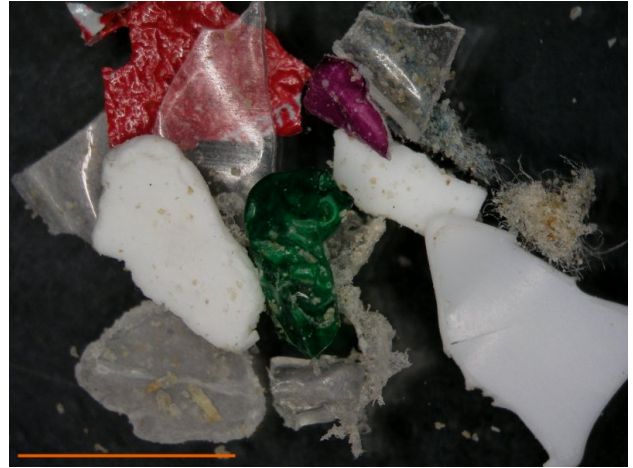
Figure 4 and 5. Presumed remnants of packaging materials in bakery products. Bar in lower left corner is 1 cm. Figure 4 (left): mixture with aluminium particles, paper and printed foil; complete overview of the recovered material from a sample with a contamination level of 0.21 % w/w. Figure 5 (right): pieces of plastic clips among other particles; complete overview of the recovered material from a sample with a contamination level of 0.05 % w/w.