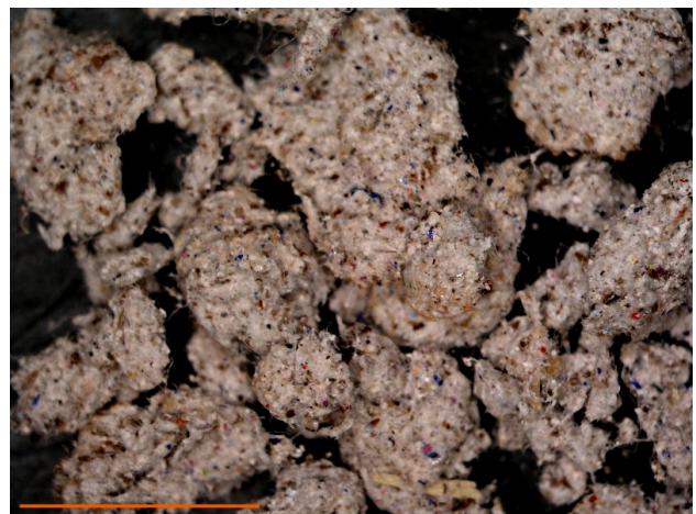
Figure 6 and 7. Presumed remnants of packaging materials in a cocoa products and in a sweet syrup. Bar in lower left corner is 1 cm. Figure 6 (left): aluminium foil and plastic; complete overview of the recovered material from a sample with a contamination level of 0.2 % w/w. Figure 7 (right): conglomerates of paper fibres collected from a sweet syrup; part of the recovered material from a sample with a contamination level of 0.44 % w/w.

With only a few exceptions, the average levels of foreign materials found are low. An examples of the full amount of recovered material at the average level of 0.05% w/w in bakery products is shown in Figure 5. A notable situation occurs in the category of syrups of sweets. Up to 2007, considerable levels were found, while from 2008 these levels are principally lower, and actually lower than found in several other categories of products in the same years. Only in a few other cases, i.e. cocoa products in 2006 and other products in 2008, it is helpful to go in further detail. Such a more detailed presentation can be achieved by considering the individual samples with relatively high levels of foreign materials. The levels are considered “high” only in a relative way, since no level higher than 0.71% w/w was found. In order to illustrate the effect of a tolerance limit of 0.15% w/w in the