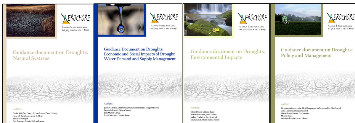
Figure 3 XEROCHORE's Guidance Documents.

The Guidance Document on the Natural System explores hydroclimatic aspects of drought, propagation of meteorological droughts into hydrological droughts, land-atmosphere feedbacks; integrated drought assessment framework (atmosphere and land) and drought monitoring (incl. early warning) and forecasting. The review of Drought Impacts and Water Demand/Supply Management Options synthesizes knowledge on economic, social and environmental impacts of droughts. The Guidance Document reviews recent drought cases, methodologies used for the impact estimation; practical issues making the assessment difficult; and research gaps to which future research should be directed. A wide range of water demand- and supply management (WDM and WSD) instruments have been reviewed and experiences from their application synthesised. The review of Drought Policies and Management provides an overview of the European and international policies and management efforts addressing droughts.