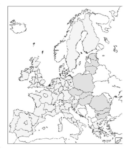
Figure 1: European Union NUTS 1 regions

In our work, a variety of data sources have been considered in order to collect the relevant data on livestock production, slaughtering and meat consumption. We adopted for our model the Level 1 Nomenclature of Territorial Units of Statistics (NUTS 1) (European Union, 2003), which divides the European Union in 97 regions (Fig. 1). Production and consumption data