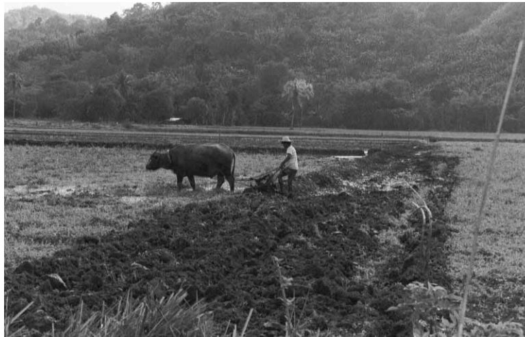
Construction of a new rice paddy

The first approach is inductive. This means that real-world data come first and that the researcher then tries to find relationships within these data. In the project, many of the real-world data are compiled in a Geographic Information System (GIS), such as maps of land use, slopes, population and roads. The researcher then tries to identify associations between land use and possible physical, social and economic causes ('driving forces') of this land use and its changes, using statistical techniques such as