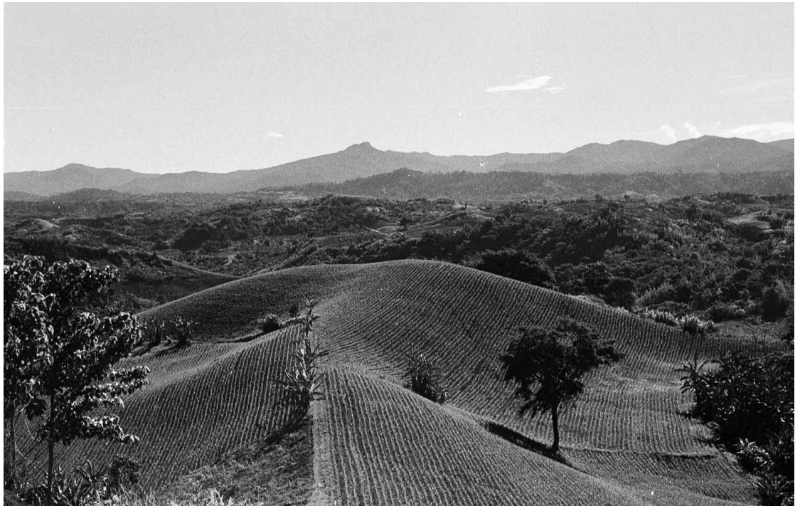
Cultivation of yellow corn as a cash crop is an important land use in the area

The other approach is more deductive, essentially working the other way around. First comes what the researcher himself, on the basis of theories and field work, assumes to know about why farmers make their location and land use choices. All these assumptions are then brought together into a computer model that can generate demographic and land use change maps. In the WOTRO programme, a multi-agent model (MAM) has been designed for this work. The model is then analysed to understand its internal logic and subsequently parameters of the model are calibrated so as to form a best fit with reality. In terms of natural 'versus' social science, this approach means that social science comes first and that natural science is added, e.g. in the form of soil quality, slopes and distances. Prof. De Groot: "If we assume, for instance, that farmers work for profit and then calculate the costs and benefits for various crops including the transport