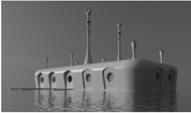
Figure 4. The design for a floating mosque in which seawater is used to regulate the interior climate.