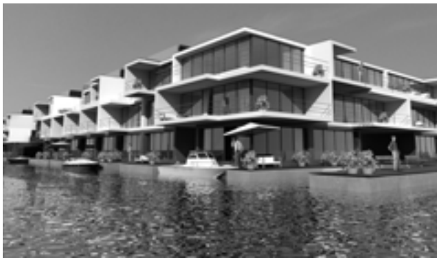
Figure 6. A floating apartment building for Naaldwijk, the Netherlands.