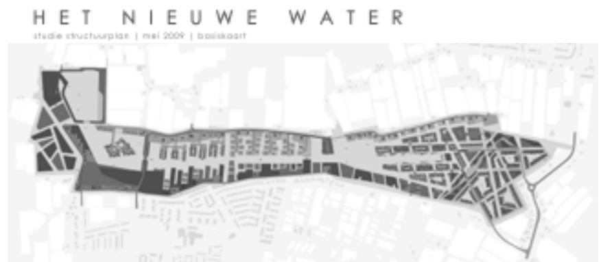
Figure 1. The master plan of one of The Netherlands first large-scale de-poldering projects, integrating housing, water storage and ecology.

A next step would be to expand the urban fabric beyond the waterfront: building normal urban configurations on water locations, with normal densities and all the usual typologies. Water-based neighbourhoods that look and feel just like traditional land-based areas, but only happen to have a floating foundation that allows them to cope with water fluctuations. Logical places to start expanding the urban fabric beyond the waterfront are the old harbours, where a lot of space can be found close to the centre and where square meter prices are lower than in the centre.