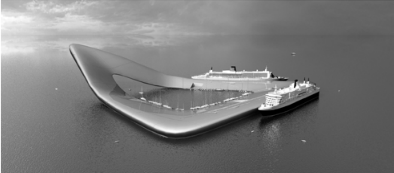
Figure 2. The proposal for a floating cruise ship terminal that allows three of the world's largest cruise ships to moor simultaneously.