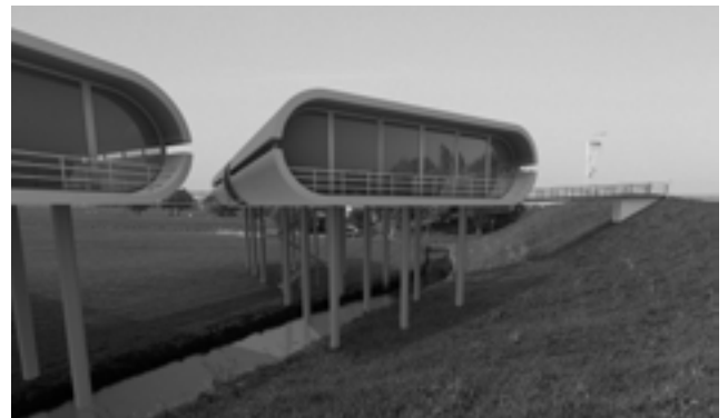
Figure 7. Raised dwellings allow flood zones to be used, while ensuring dry feet in times of high water levels.

space leaves no permanent damage to the location, making it a sustainable strategy. Floating city parts allow the emergence of what we call consumer urbanism: the scarless relocation of city parts to another city, able to respond to changing requirements in a global market for urban components.