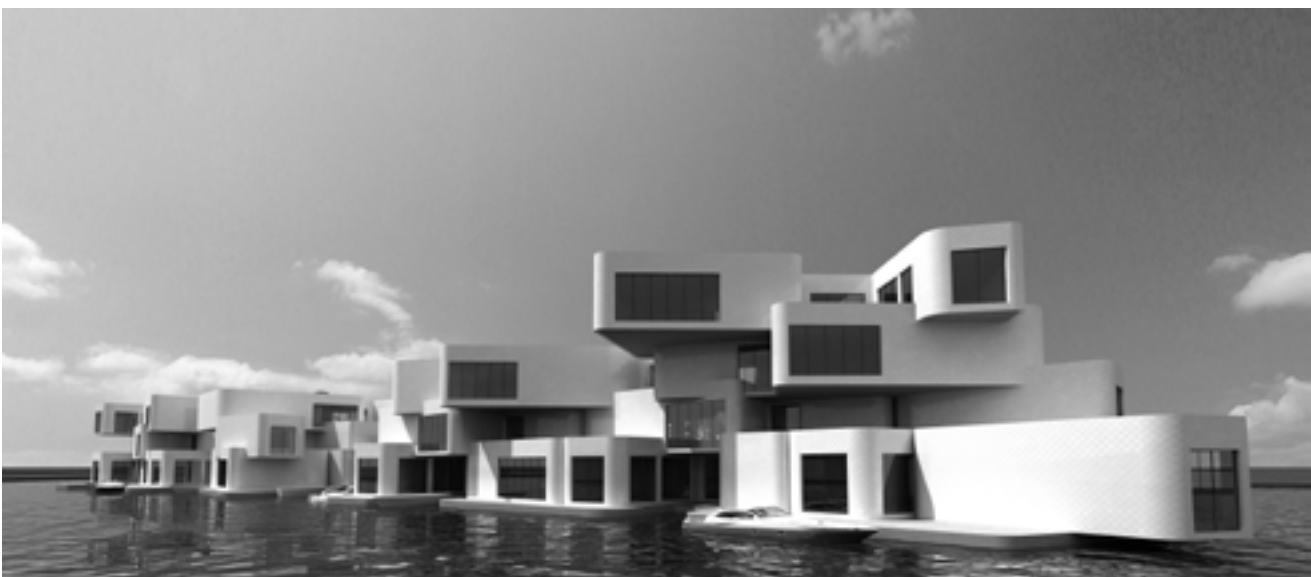
Figure 3. A floating apartment building with some 60 luxury apartments overlooking the water.

Floating city parts allow a site to be used for different purposes in the course of time, by relocating functions without leaving a trace - the temporary use of