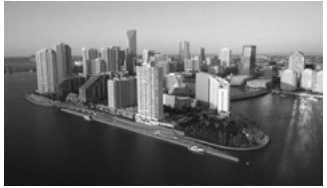
Figure 5. The proposal for a floating boulevard for Miami.