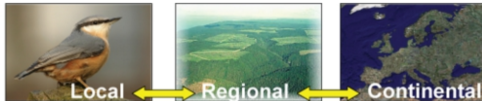
Fig. 1. The relation between species, habitats and earth observation data ( http://www.EBONE.wur.nl/UK/Project+Work+Packages/WP5+Inter-calibration/ , accessed March 16, 2010)

correspondence matrices. [...] And these correspondence matrices actually help us to identify how good the link is between the two.