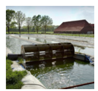
Ingrepro's open pond cultivation

Of special importance is the high biomass production capacity of some algae of probably between 20 - 50 tons of dry matter per hectare per year, making this crop even superior to e.g. beet and potato.