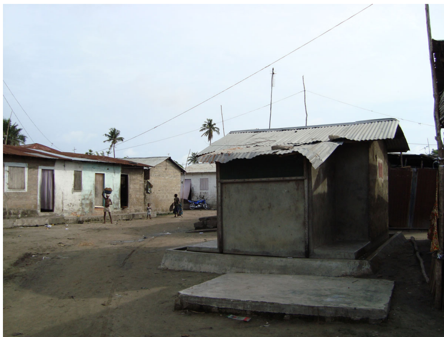
Figure 3 One of the experimental huts (on the right) used for the trial. These huts are located inside Ladji village and houses can be seen on the left

The bednets used were white 100 denier polyester netting (SiamDutch Mosquito Netting Co., Thailand) measuring 2.11 m length × 1.63 m width × 1.84 m high