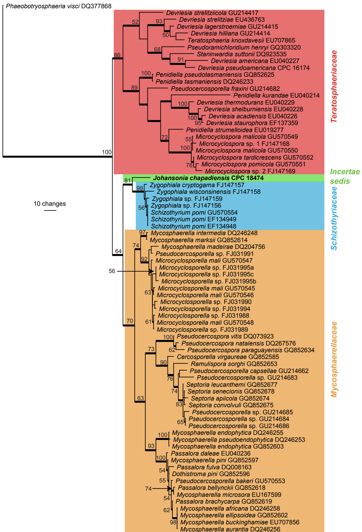
Fig. 1. The first of 1000 equally most parsimonious trees obtained from a heuristic search with 100 random taxon additions of the LSU sequence alignment. The scale bar shows 10 changes, and bootstrap support values from 1000 replicates are shown at the nodes. The novel sequence generated for this study is shown in bold . Branches present in the strict consensus tree are thickened and important lineages are colour-coded. The tree was rooted to a sequence of Phaeobotryosphaeria visci (GenBank accession DQ377868).