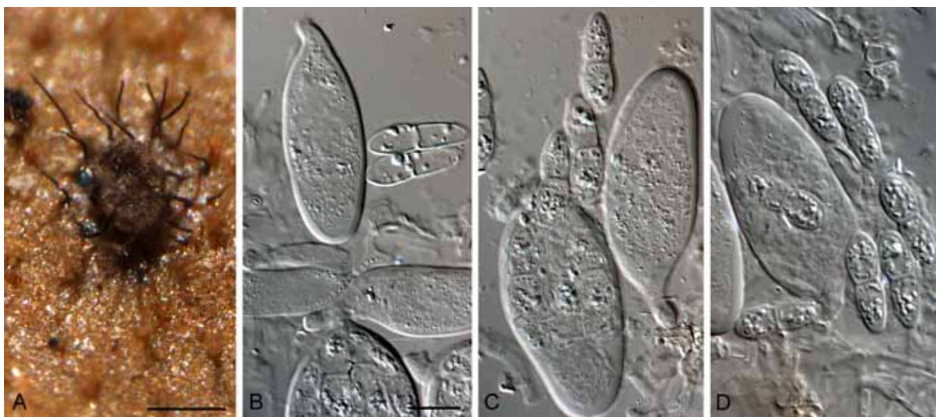
Fig. 3. Johansonia brasiliensis (CBS H-5029 – isotype). A. Ascoma on leaf. B–D. Asci and ascospores. Bars: A = 300 µm; B–D = 10 µm.