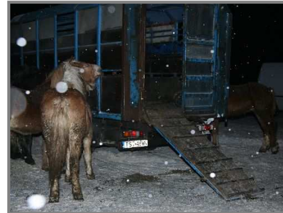
Loading ramp too steep