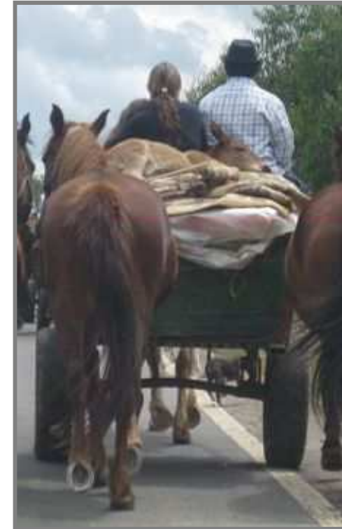
Foal tied on carriage