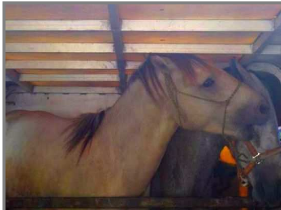
Insufficient ceiling height