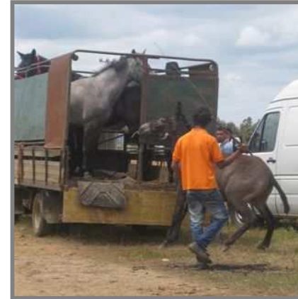
No loading ramp