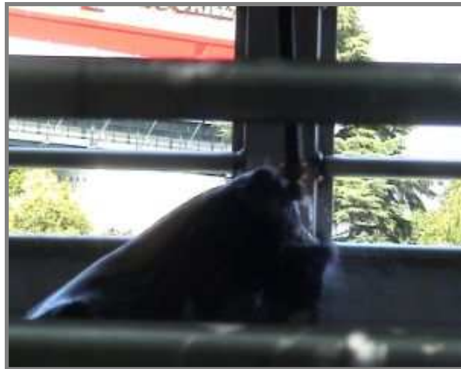
Horse trying to drink from the broken water hose hanging down from the ceiling of the truck.

For various reasons horses are rarely watered every 8 hours during transport as legally required: