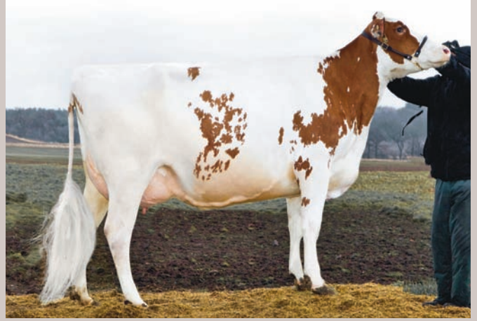
Ian Milne's Classic daughter Carcary Classic Nightingale VG85