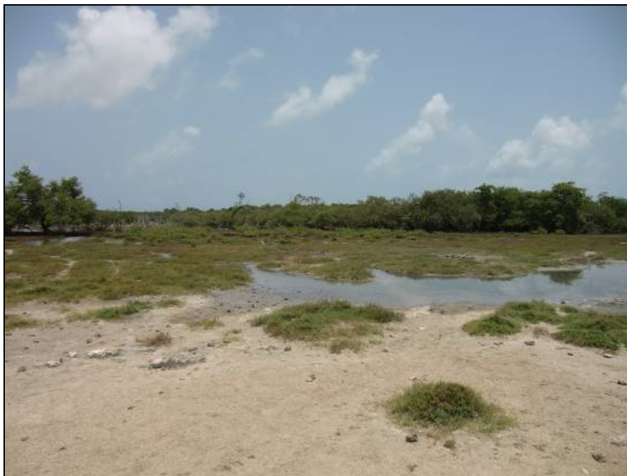
Figure 8. Reforestation demonstration pilot project area of high marsh salt flats and Avicennia germinans mangrove forest fringe. Grazing is intense in this area. Exclusion of grazer should be sufficient for the intensively trimmed Avicennia bushes (upper center) to grow out to tree stature.