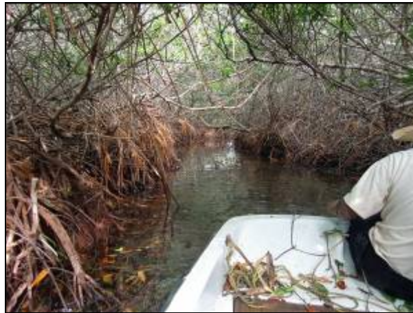
Figure 9. Former mangrove channels which have been grown shut for years have recently been hacked open to re-establish their nursery function.

The Lac area is an area clearly in high and growing demand by visitors and water sporters. It is also an area of exceptional historical and cultural significance to native Bonaireans, possibly exceeded in significance only by the plantations of Slagbaai and Washington. However, while non-intrusive traditional recreational use of Lac by Bonaireans has become gradually limited, this has been replaced by touristic use that has increased dramatically to high levels, and which probably regularly exceeds local carrying capacity in both ecological and social sense (cruise tourist swimmers at Sorobon, R. de León, pers. obs). Involvement of scouts and youth rangers in activities such as mangrove channel exploration and traditional maintenance by trimming mangroves (which used to be done by fishermen) provides a possible new vehicle by which the youth can stay involved in this part of their cultural heritage. In Papiamentu this concept can be captured succinctly by the expression "biba bo kultura" (literally "live your culture").