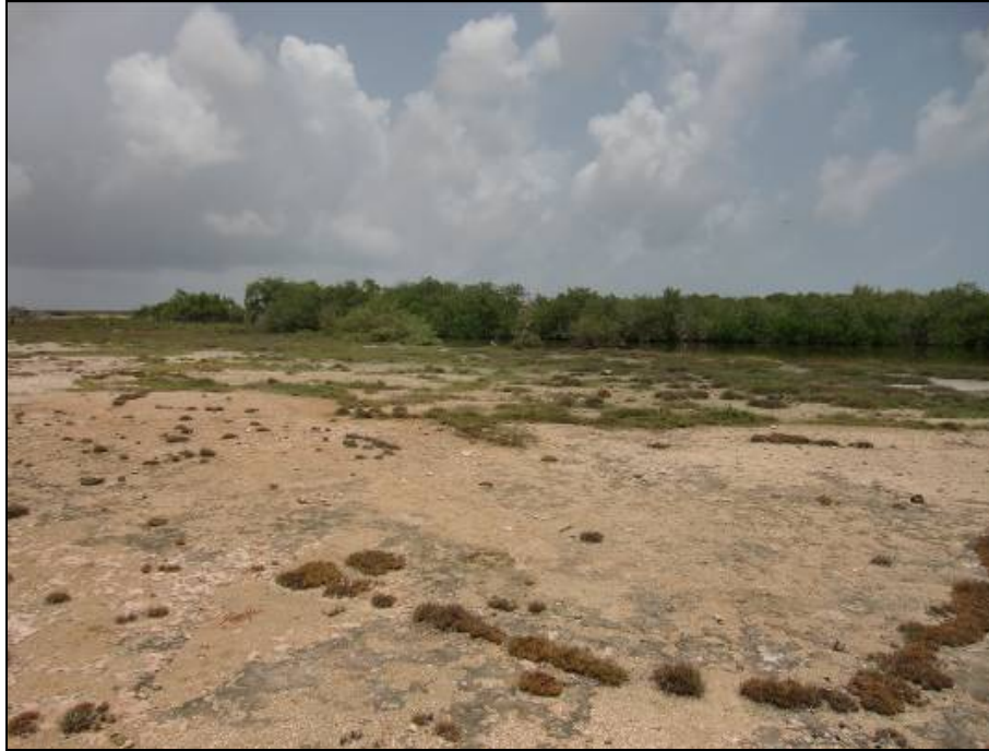
Figure 7. Red mangrove restoration site at Awa di Wanapa. View facing figures 5 and 8 . The reference red mangrove and aquatic seagrass habitat is to the left center of the picture. The restoration area is in the foreground stretching towards the mangrove slough in the background. In-filled sediments will be removed to establish depth and tidal hydrology identical to that of the reference mangroves.