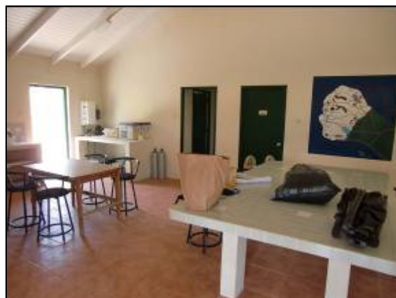
Figure 3. Interior view of science accommodations at Washington-Slagbaai National Park.