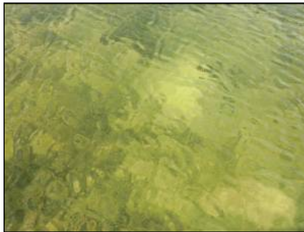
Figure 10. Greenish water and bottom growth of filamentous algae on the seaward margins of the mangrove fringe (Boka di Pos area). Juvenile fish school densities were higher than in the clear open water of Lac Bay.

These are parts of the central lagoon areas up to about 100 meters from the mangrove fringe. The water and benthic zones were clearly greenish. Fish community composition differed obviously with the open-water areas (many more Atherinidae, different Gerridae) and juvenile fish densities were higher (also schools of juvenile "masbangu": Decapturus ). The aquatic and benthic algae were evidently serving the important role of converting the (coral-toxic) nutrients from the inner mangrove areas into food for the Lac fauna.