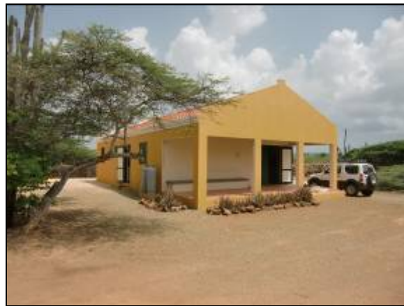
Figure 2. Kas sientifiko science accommodations at Washington-Slagbaai National Park.

Starting point for this exercise was the list of 18 action points from the June 2010 Lac Bay assessment by Debrot et al 2010 (IMARES Report C066.10). From these, 8 projects were identified in which students and interns were judged able to participate, given proper preparation and both academic and local guidance and support. The advantage to LNV and other parties of the involvement of students and interns for field aspects is that total project costs can be kept lower (than for projects in which students can only play a minor role). In this Stinapa is essentially willing to provide basic free lodging to interns and scientists at their science accommodations at the entrance of Washington Slagbaai National Park. The action spear points will require funding and various permits from the Island government of Bonaire. With LNV various funding options were reviewed and the need for permits was discussed with DROB Bonaire. DROB envisioned few problems with the required permits for the key action points proposed and would cooperate in providing the forms needed for permit requests, and full assistance in processing these. Other local parties spoken to and who were ready to assist or participate in various ways are Jerry Ligon (birds), Dr. Peachey of CIEE (Council on International Educational Exchange) (corals and seagrass) and Dr. S. Engel (corals and seagrass general).