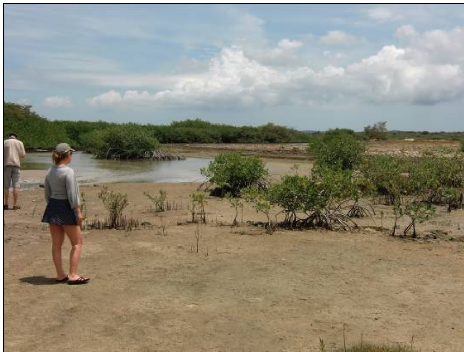
Figure 6. Dr. Erik Meester and Dr. Diana Slijkerman at the Kreek di Koko red mangrove restoration site (foreground). Re-establishing productive fish nursery waters and mangrove vegetation will be based on re-establishing water depth in the sediment-filled area in the fore ground. The "reference" mangrove habitat area is located just outside the picture frame to the left.

Two sites were chosen for the pilot demonstration study for red mangrove reforestation and revitalization of fish nursery habitat. One lies on the land side of Kreek di Koko (Figure 6) and the other at Awa di Wanapa (Figures 7). In addition, two restoration sites were also chosen for restoration of the Avicennia germinans forest in a area where the main problem is overgrazing by feral livestock (goats, sheep, donkeys) (Figure 8).