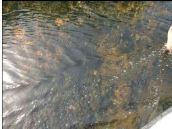
Figure 11. Brownish mangrove tannin and H^2S -odorous waters of the interior mangroves (interior Boka di Koko).