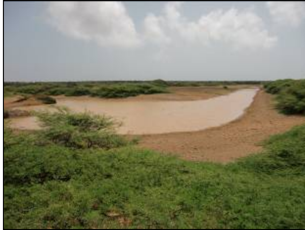
Figure 12. The big water catchment dam at Bacuna prevents essential freshwater inflow into Lac and cuts off the ecological connection for freshwater fauna to a large hinterland catchment area. The water in the dam is from downpours the night before and would have been of great value to Lac mangroves and freshwater shrimps and fishes, were it not for its obstruction by the dam.