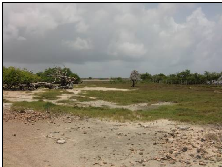
Figure 5. Mangrove zonation in Awa di Lodo di San Hose Lac, near one pilot study site. Left: dying Conocarpus erectus , center: dry high marsh flats; right: Avicennia germinans , the mangrove tree best capable of surviving in hypersalinity. Missing is the red mangrove, which is found under suitable conditions further towards the right, but outside the picture (in Figure 7).