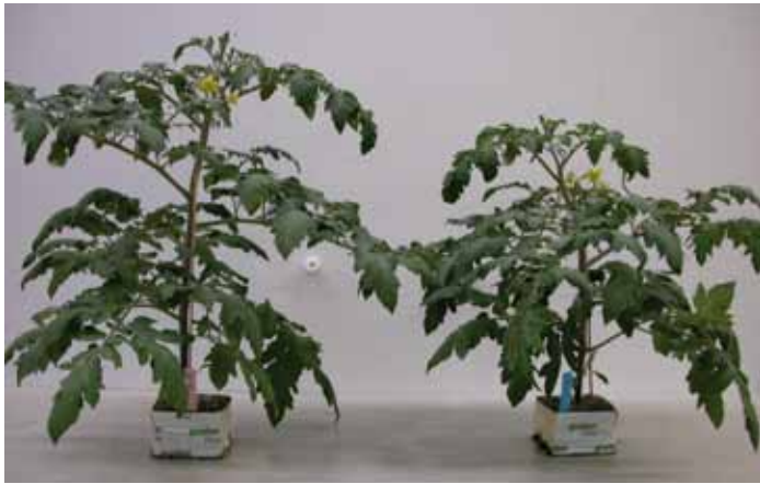
Figure 1. Tomato plants without DROP (left) and with DROP at the start of the light period (right).

Aim of this research is to establish the time of the day that plants are most sensitive to a temperature drop (DROP) and to determine the effects of a DROP on plant growth. Energy consumption can be reduced by allowing lower greenhouse temperatures in the morning.