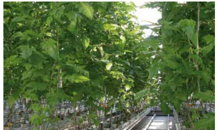
Figure 4. Overview of the tomato crop in the greenhouse.

The temperature treatments did not affect plant length, internode length, leaf length and width, number of internodes, weights of leaves, stems and fruits, leaf area and fruit diameter.