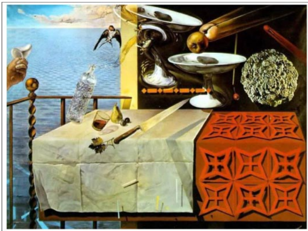
Nature Morte Vivante (Still Life - Fast Moving)

Fig. 2. The challenge of integrating diverse disciplinary perspectives is to retain the precision of diverse elements of the whole to create an overarching picture. The results may seem strange, unrealistic, and surprising, but they allow for novel approaches and new questions to arise. The painting is Nature Morte Vivante (Still Life Moving Fast) by Salvador Dali, 1956, 125x160 cm. The original is in the Salvador Dali Museum, St. Petersburg, Florida, USA.