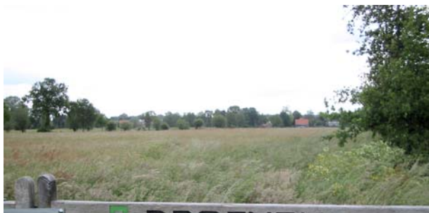
Low-cost, wet biomass (such as grass from grasslands that are no longer used for feed production) are primarily composed of lignocellulose and have great potential as feedstock for fermentative production of biofuels