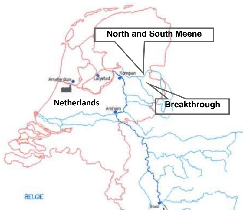
Figure 1. Location of the Breakthrough and North and South Meene cases in the Netherlands.

Finally, a brief document 5 was presented at the well attended annual regional water managers' meeting in May 2009, and six interviews were held in subsequent months with stakeholders to discuss its contents. In addition, official and grey documents were consulted.