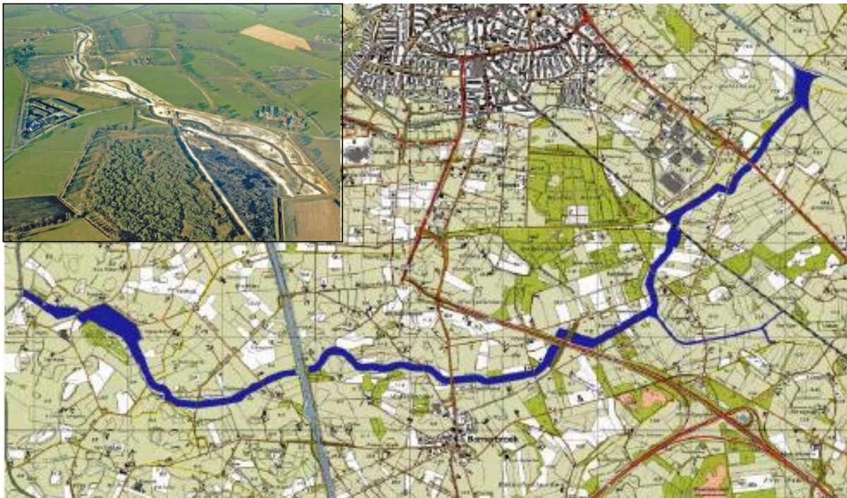
Figure 2. First stretch of Breakthrough brook (inset), and map of the middle stretch of the Breakthrough channel in 1999.

Realising its dependence on other governmental actors and their resources (van den Brink and Meijerink, 2006), the Water Board started to 'span boundaries' early on by involving other actors and sectors in its policy network. It invited leading municipal and regional public officers, as well as a regional Farmers' Union leader, to sit on the project's steering committee. The plan was received well by other actors in the policy network, as it linked well with their ambitions. To initiate the proceedings, the provincial authorities, responsible for the planning of ecological corridors, indicated that they were going to cooperate on condition that the plan would conform to the provincial Nature and Countryside Policy Plan, which made it subject to environmental conditions such as a wide green margin bordering the river banks. The banks of the new stream would have to be widened by 25 m of greensward on both sides in rural areas, and a further environmental reservation of up to 75 m where the stream bordered on urban functions and infrastructure. This implied a rather larger land take than expected, and could easily clash with a new business park area, which would sit right next to the middle stretch of the Breakthrough.