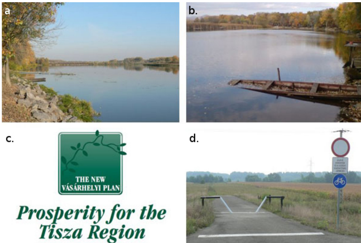
Fig. 2. a) Tisza River at Tiszadada; b) Oxbow lake: traditional water management used oxbows and creeks for water regulation. This inspired the new water management plan; c) Logo and motto for new Vásárhelyi water policy in government brochure (VITUKI 2004); and d) Bicycle lane on retention reservoir dike for rural development.