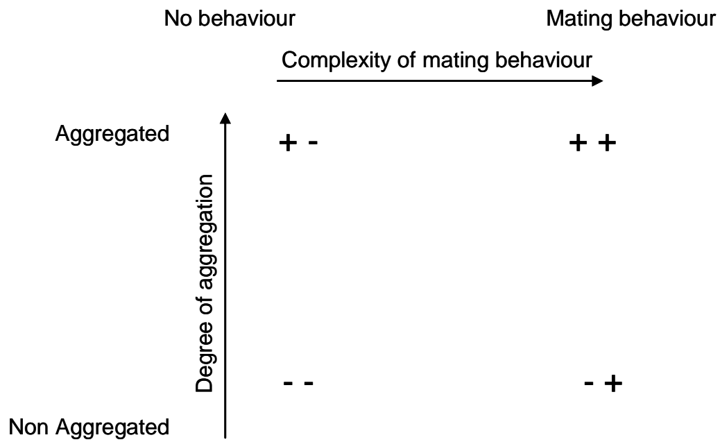
Figure 2: Classification scheme presenting the degree of vulnerability with - - indicating low, - + mediocre and + + high vulnerability