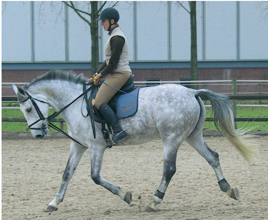
Figure 3. A horse ridden “rollkür” (round and deep with a draw rein) in the study of Sloet van Oldruitenborgh-Oosterbaan et al. (2006)

shows that the treatment resembled a posture in which the horses were ridden with the nose behind the vertical (comparable to HNP3 in Figure 2), but not with the chin onto the chest. Riders were not blind to the treatment and half of the horses started with a test in LDR, the other half of the horses in a test with a natural posture (comparable to HNP1 in Figure 2), with only light rein contact. During the tests horses were trotted and cantered for several minutes.