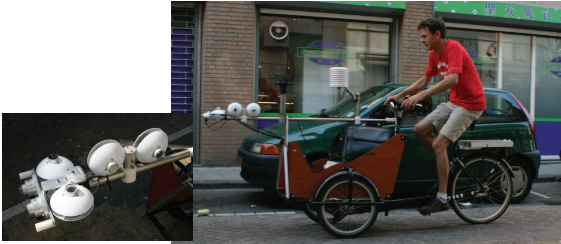
Fig. 2: Mobile biometeorological station mounted on a cargo bicycle

The data were recorded at 1 Hz and combined with concurrent readings from a GPS device. The instruments were powered by a solar panel mounted on the baggage carrier. Measurements were performed along two previously determined routes through a number of characteristic urban districts, including an industrial area, an older residential area, a city park and a harbour area. The routes were photographed at fixed intervals from 0.5 m above the ground with a fisheye lens pointing upwards. The observations were carried out during three 2 h time intervals on 6 August 2009. This was a warm day with maximum air temperatures of about 30°C. Data from the traverse measurements were compared with recordings from a nearby synoptic weather station outside the urban area. Fig. 2 shows a detailed view of the front of the bicycle.