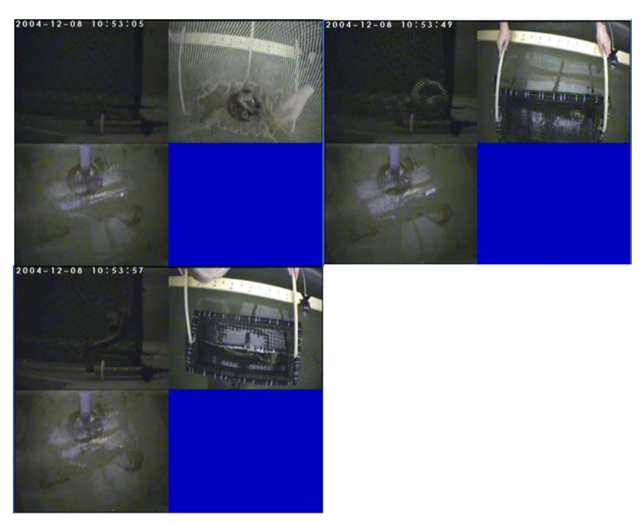
Figure 3 Sequence of a dogfish exposure in the "near field" range. The fish arrived with a body curl (top picture left), after the exposure (top right picture (note the two LED indicators activated at the left hand of the operator). The fish unfolded as a post-reaction (bottom picture), but adopted the original body curl shortly after.