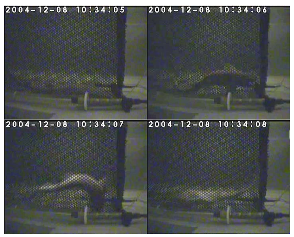
Figure 3 A series of successive video frames, showing the position of the animal at the bottom, top left, and the contraction (top right) and post-reaction (reverse), bottom left and right, of a dogfish exposed in the "near field" range.