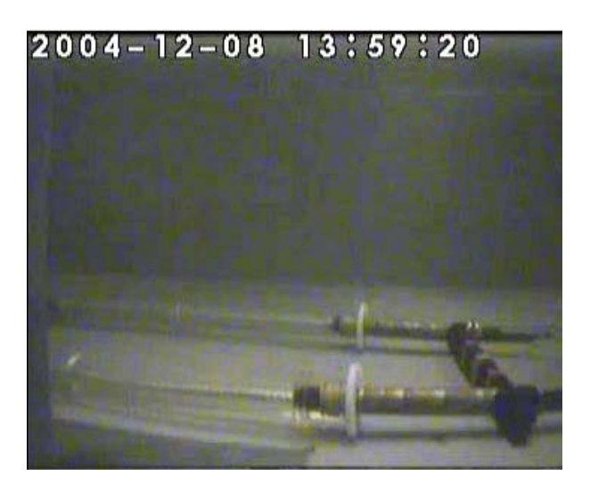
Figure 2 Underwater detail of the conductors fixed at a distance of 325 mm and the isolated extension of 0.6 m.