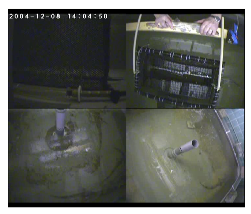
Figure 1 Video image of the of the research tanks with top left the underwater side view on the exposed area with the cage of flexible polyethylene netting positioned between the conductors and top right the view from above with a dogfish being measured. Bottom left is the "near field" recovery tank and bottom right the "above field" recovery tank (the date information is invalid (recorder config bug).