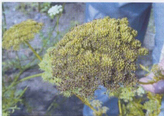
Umbel of carrot attacked by Alternaria

I hope to have shown that seed science holds many of the clues and solutions for a successful organic agriculture."